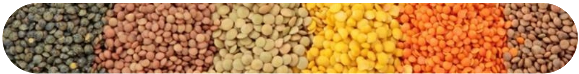
ALL TYPES OF PULES